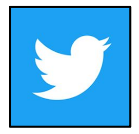
Twitter Handle @PESJackets

Facebook Group Pickett Elementary School